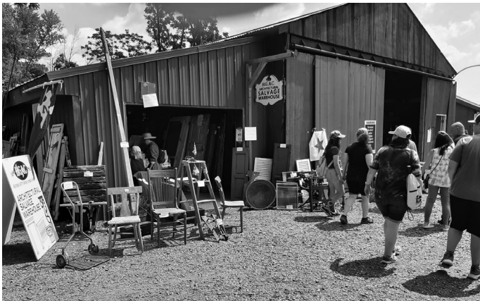
HGAC Architectural Warehouse