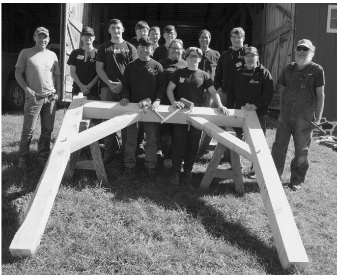
Youth Initiative Learning Lab