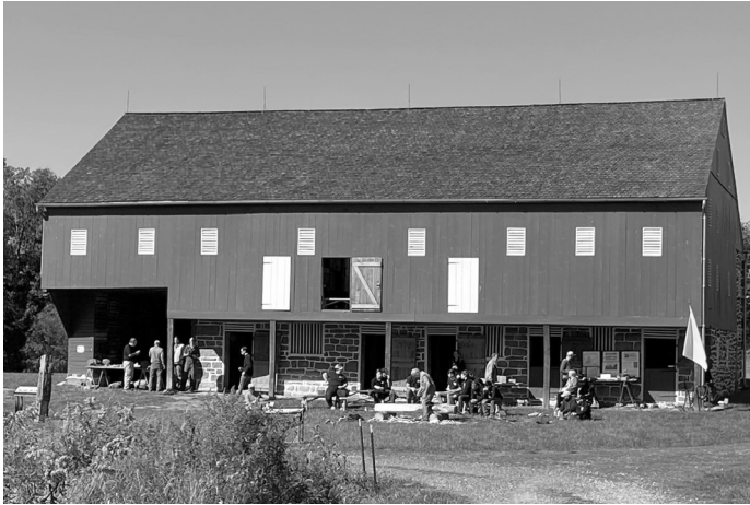
HGAC Volunteers at Spangler Barn